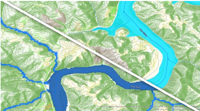
Fathom fluvial and pluvial flood areas (left) include smaller drainage areas not covered by available FEMA flood hazard maps (right).

Although Fathom data is available statewide, users planning for areas of coastal Virginia should consider instead using higher resolution coastal and rainfall-driven flood hazard data available from DCR, accessible via the Flood Resilience Open Data Portal .