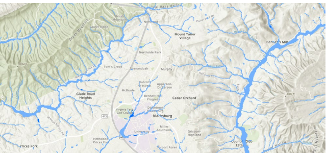
Maps depicting the 1% AEP (1 in 100 year) recurrence interval flood event in the Blacksburg area. Top: FEMA’s National Flood Hazard Layer. Bottom: the 2020 Fathom flood layer.