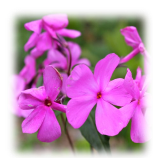
Bloom: April-Early Summer

ID Tip: Bright pinkpurple flowers in clusters. Will have 5 petals while Dame's Rocket only has 4 petals.