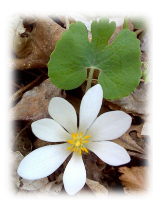
Bloom: March-April (only blooms for a few days)

ID Tip: Large white flowers with yellow anthers. Leaves kidney bean shaped and lobed.