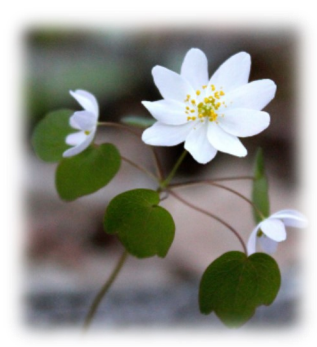
Bloom: Late March-April

ID Tip: White to pinkish flowers. Multiple yellow stamens. Leaves are smooth and three-lobed.